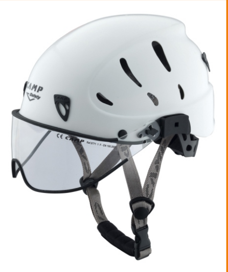
ARMOUR WORK ASSEMBLED WITH VISOR REF.0771 AND AND EAR PROTECTIONS